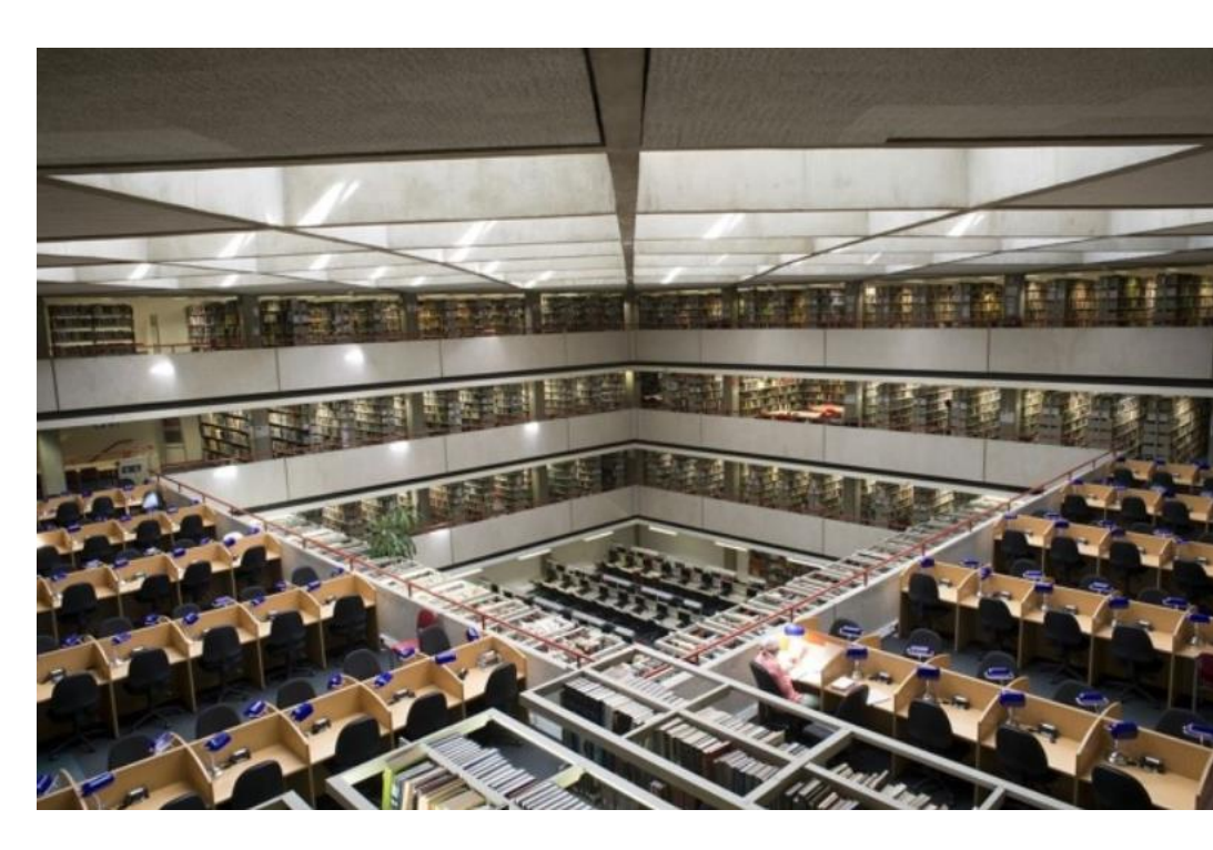
SOAS University Library